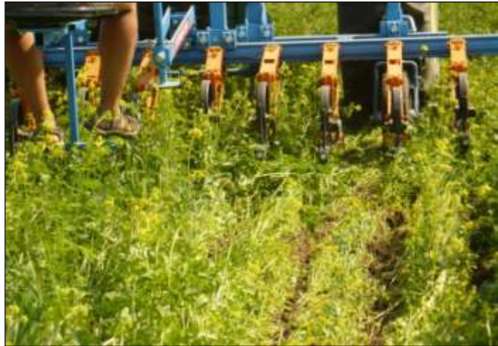
Figure 1. Schmotzer hoe cultivation between rows of wheat.

In addition, the plots with nine-inch row spacing were cultivated with a Schmotzer inter-row hoe on 24-June. The Schmotzer hoe, imported from Germany, is a manually-guided, rear-mounted implement that can be used to cultivate in between wide rows of wheat (Fig. 1). This allows weed control to take place later in the growing season, after plants are well established.